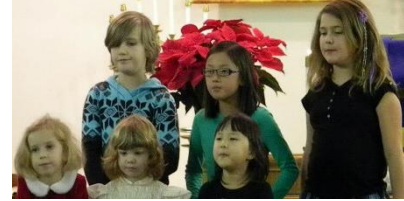
Christmas Program 2012