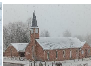
Even at Church