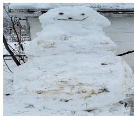
& the Snowman