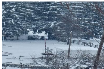
The Snow cometh