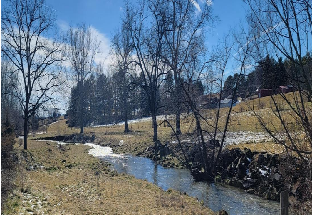
"The Creek", with the snow melting on Feb 13 th