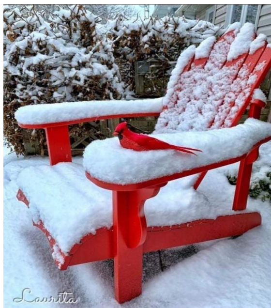
Coming home to find a "heavenly visitor". (Past pictures from Facebook)