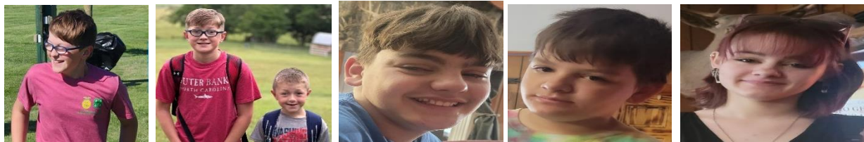
In Ag Olympics