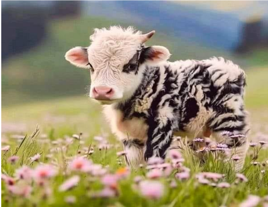
(Mini-Cow Courtesy I Love Cows on Facebook)