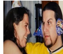
Happy 22 nd