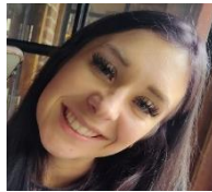
Char is 25