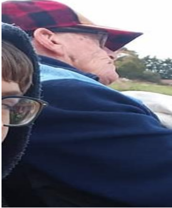
Hay Ride October 2018