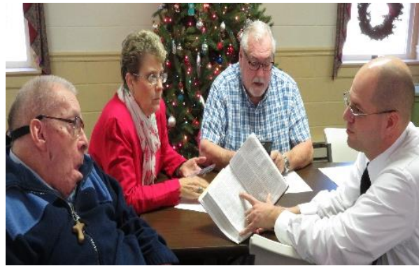
Studying "Awaiting the Already" in Sunday School December 2018