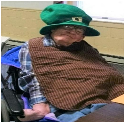
Playing St Patrick at the UMM Pancake Meal March 2018