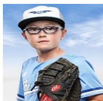
Baseball time has begun