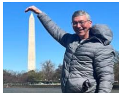
Showing off in DC