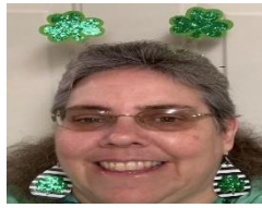
Smile day @ work