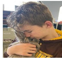
Parker & Bun