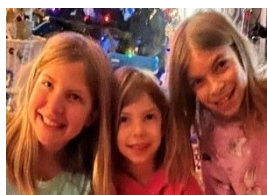
the Crisman girls