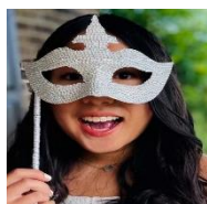
7 th /8 th dance