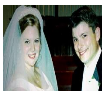
Happy 18 th