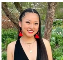
BC Spg dance