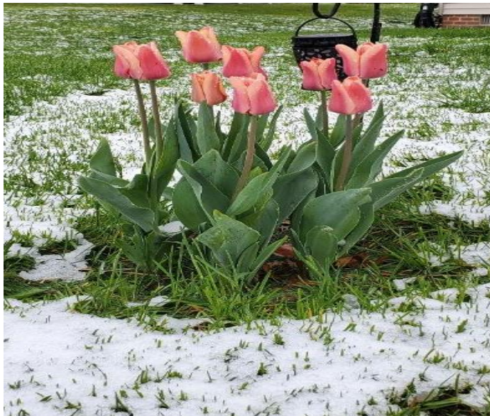
Only God can make tulips bloom surrounded by snowfall (4-18-22).