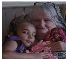
Jazz & Grandma