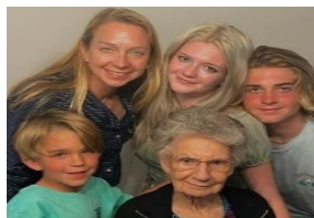
MawMaw is 91