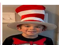
Cooper cat hat