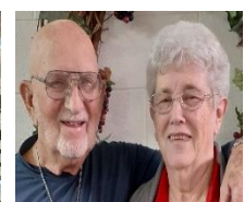
Happy 54 th