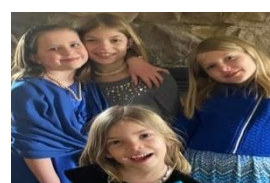
The Crismon girls