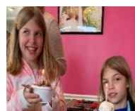
Twins are 10