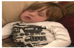
Connor'd rather sleep