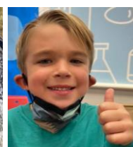
Got my shot!