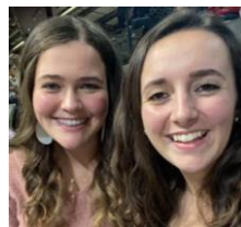
Visiting the rodeo