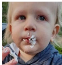
7 st s'more