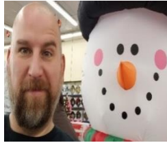
Just for fun