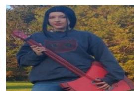
Alli, Vampire Queen